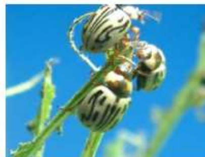
Adult of Z. bicolorata