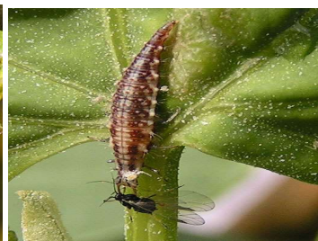
Green lace wing