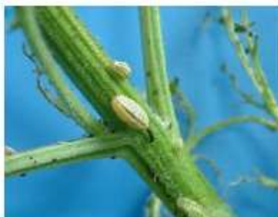
Grub of Z. bicolorata