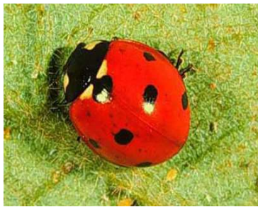
Lady bird beetle