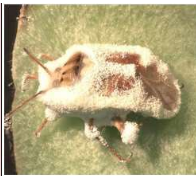
White muscardine fungus