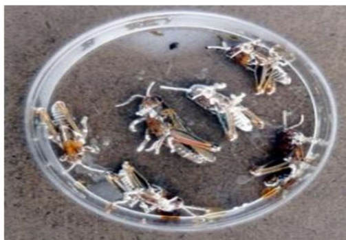
Insect infected with Beauveria bassiana

Dose : 1 gram/liter of water or 1 Kg/1000 liter of water/ha (Repeat application after 10-20 days interval)