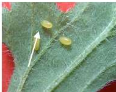
Eggs of Z. bicolorata