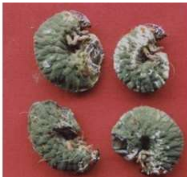
Green muscardine fungus